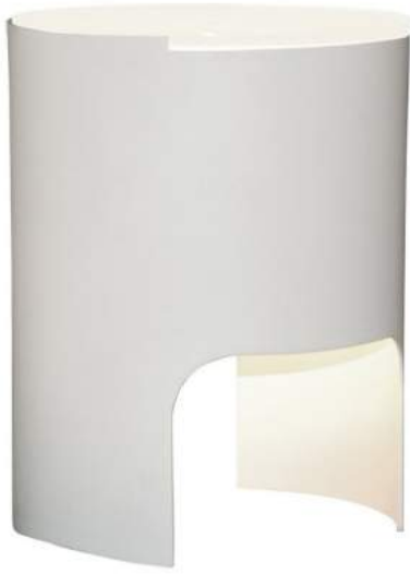
Table lamp, indirect light. Tubular aluminium structure lacquered, upper satin methacrylate finish diffuser in white or orange colour.